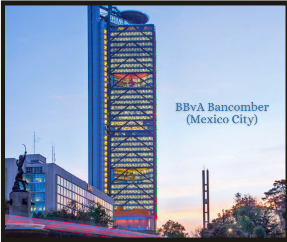
BBVA Bancomer (Mexico City)

Saturn Enterprises, Inc. is a Texas based woman owned small business (WOSB and EDWOSB) that has served diverse global markets since 1994.