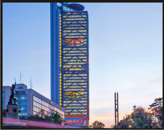
BBVA Bancomer (Mexico City)

Saturn Enterprises, Inc., a Texas-based woman-owned small business (WOSB and EDWOSB), was established in 1994 with the mission to serve diverse global markets in Latin America. We are delighted to announce our expansion into both the domestic market and federal government sectors.